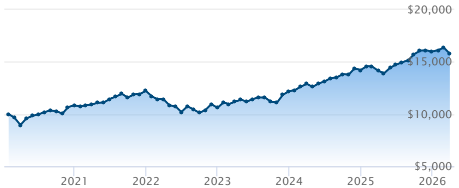
■ BMO Balanced ESG ETF (ZESG)