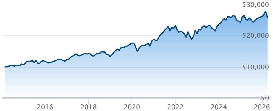
■ BMO MSCI Europe High Quality Hgd C$ Idx ETF (ZEQ)