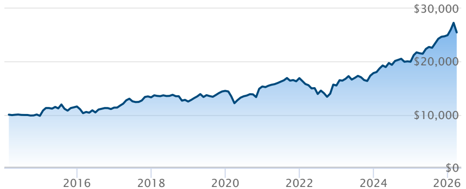
■ BMO MSCI EAFE Index ETF (ZEA)