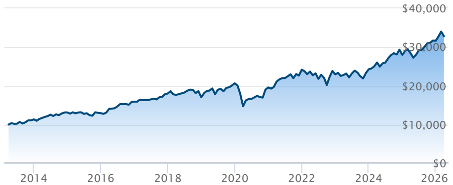
■ BMO US Dividend Hedged to CAD ETF (ZUD)

Past performance is no guarantee of future performance. All returns are historical annual compounded total rates of return and reflect changes in yield and distributions reinvested. Managed Indexed, Managed Portfolios and Market Indexed accounts credit an interest amount mirroring the net rate of return of a specified underlying investment, less a BMO Life Assurance Company daily management fee. These rates of return do not reflect the current BMO Life Assurance Company management /universal life fee which must be taken into consideration when determining the net return earned on the account.