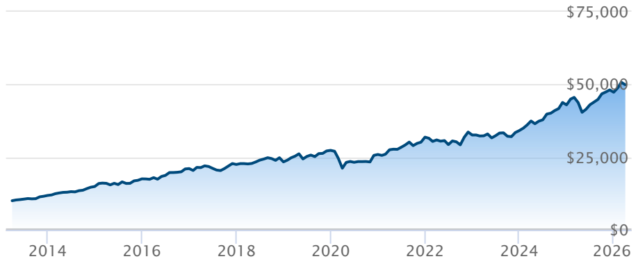
■ BMO US Dividend ETF (ZDY)