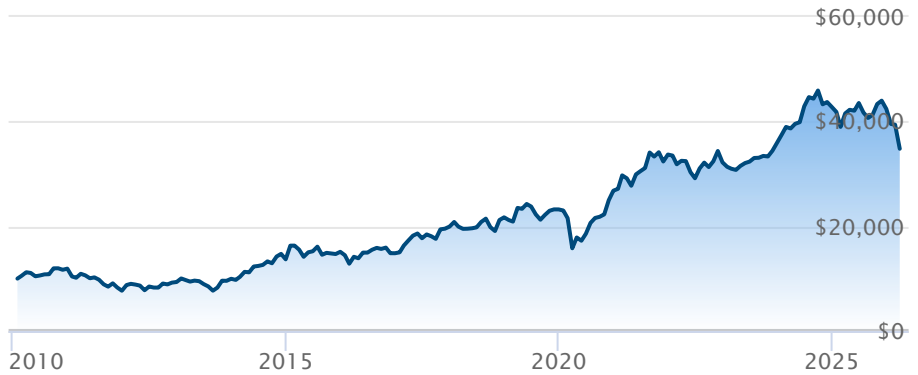
■ BMO MSCI India Selection Equity Index ETF (ZID)