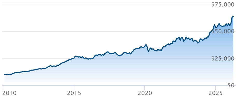
■ BMO Global Infrastructure Index ETF (ZGI)