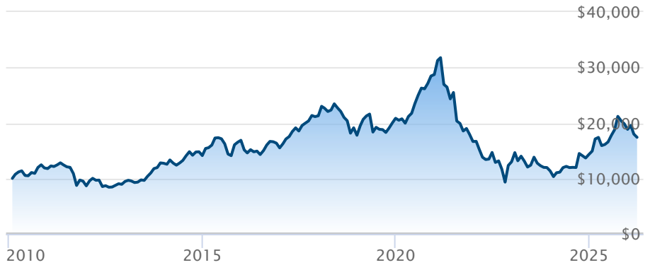
■ BMO MSCI China Selection Equity Index ETF (ZCH)