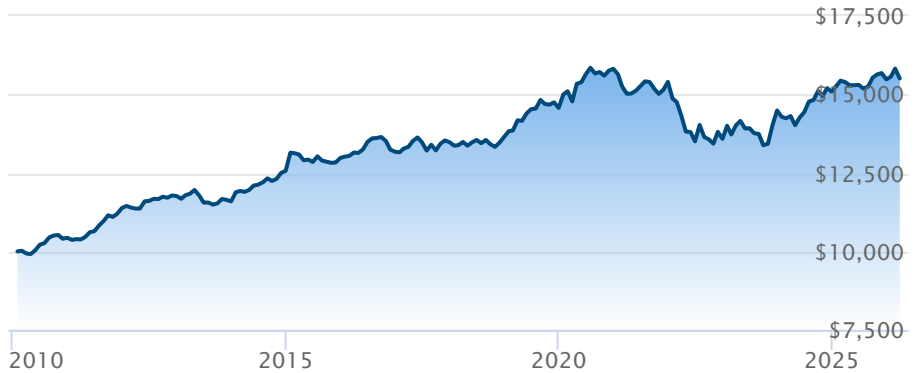
■ BMO Aggregate Bond Index ETF (ZAG)