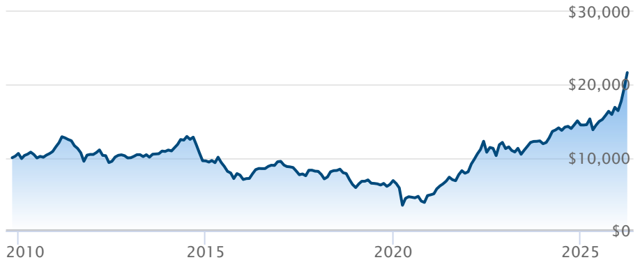
■ BMO Equal Weight Oil & Gas Index ETF (ZEO)