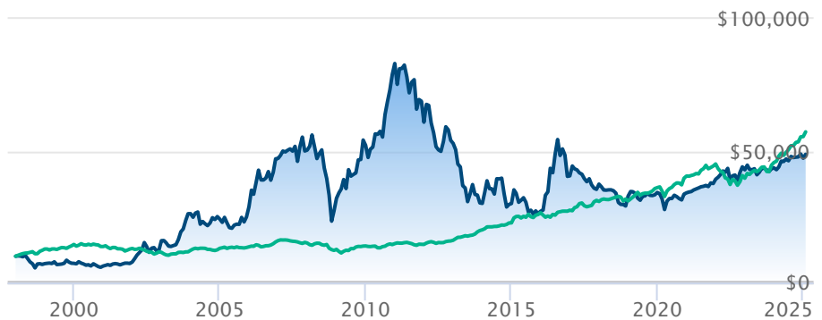
AGF Global Real Assets Fund Mutual Fund Series Funddata Global Balanced - Equity Focus Index

The information contained on this page is related only to the designated fund or funds shown above. As part of a BMO Life Assurance Company policy, you do not purchase units in this designated fund or a legal interest in any security.