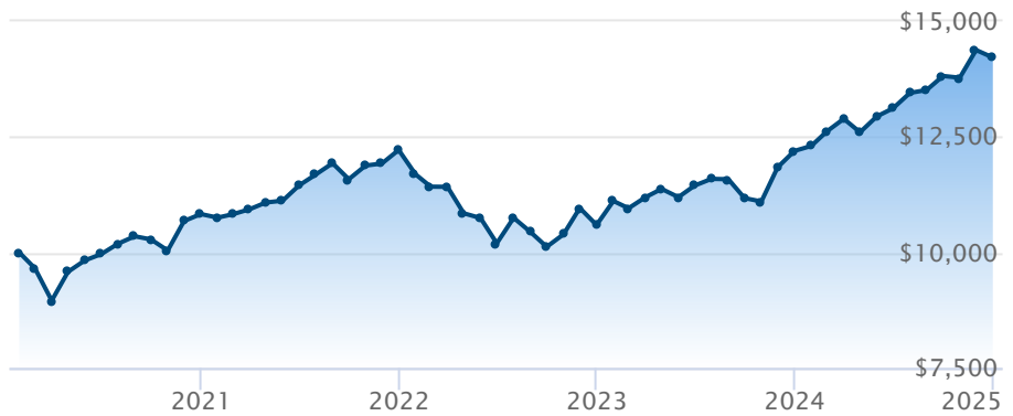
BMO Balanced ESG ETF (ZESG)