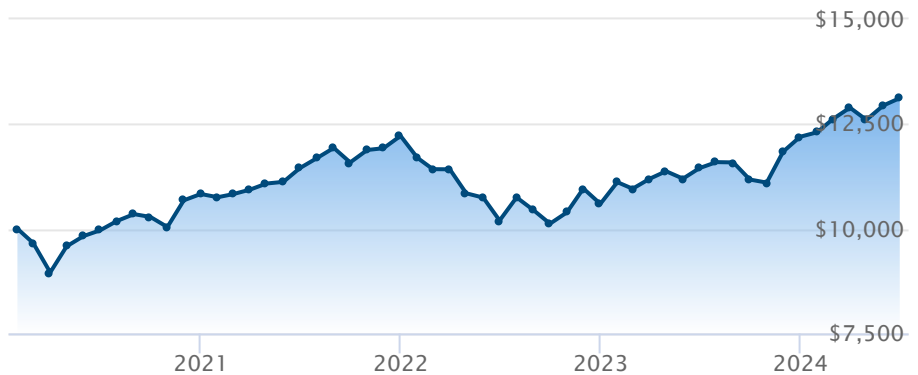
BMO Balanced ESG ETF (ZESG)