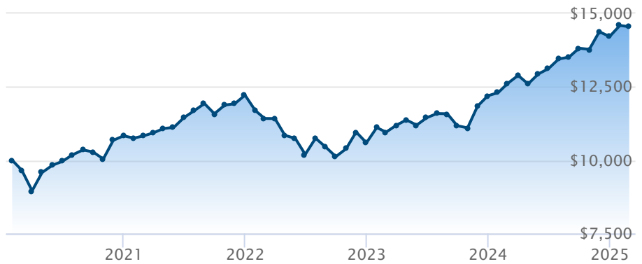
BMO Balanced ESG ETF (ZESG)