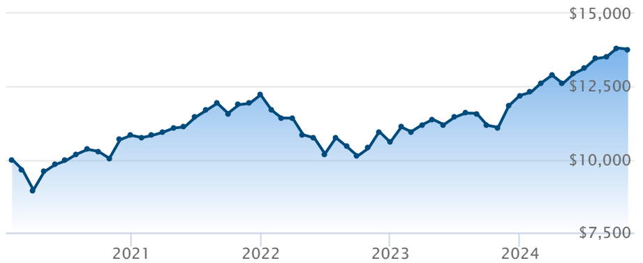
BMO Balanced ESG ETF (ZESG)