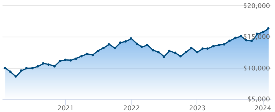
BMO MSCI USA ESG Leaders Index ETF (ESGY)