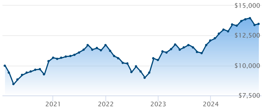
BMO MSCI EAFE ESG Leaders Index ETF (ESGE)