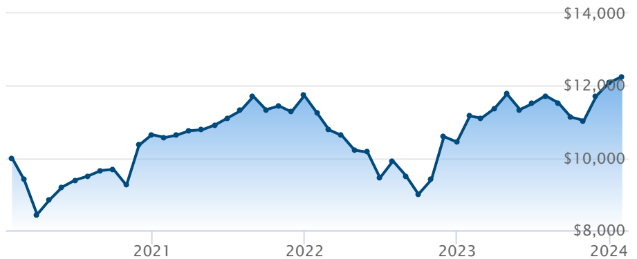
BMO MSCI EAFE ESG Leaders Index ETF (ESGE)