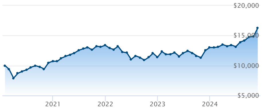
BMO MSCI Canada ESG Leaders Index ETF (ESGA)