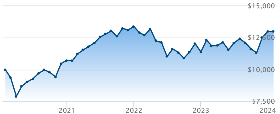
BMO MSCI Canada ESG Leaders Index ETF (ESGA)