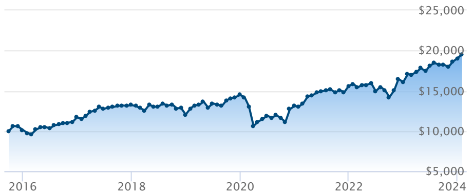
BMO International Dividend Hedged to CAD ETF (ZDH)