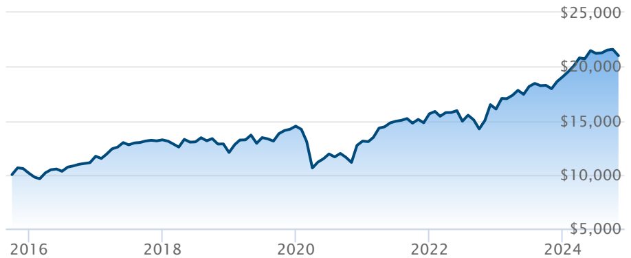
BMO International Dividend Hedged to CAD ETF (ZDH)