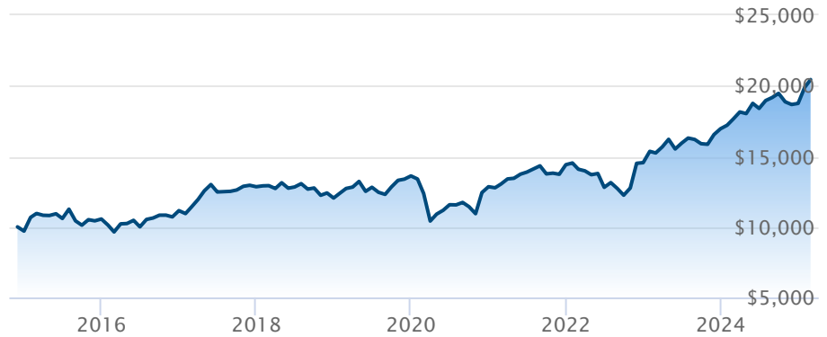
BMO International Dividend ETF (ZDI)

Past performance is no guarantee of future performance. All returns are historical annual compounded total rates of return and reflect changes in yield and distributions reinvested. Managed Indexed, Managed Portfolios and Market Indexed accounts credit an interest amount mirroring the net rate of return of a specified underlying investment, less a BMO Life Assurance Company daily management fee. These rates of return do not reflect the current BMO Life Assurance Company management /universal life fee which must be taken into consideration when determining the net return earned on the account.