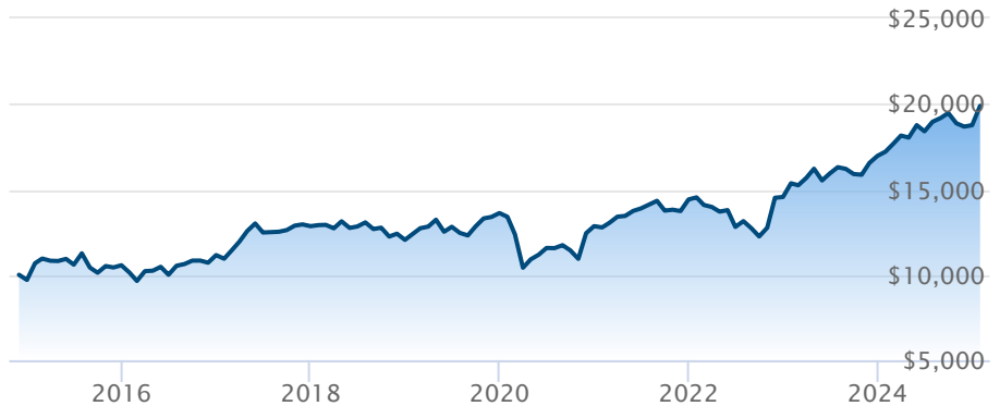
BMO International Dividend ETF (ZDI)