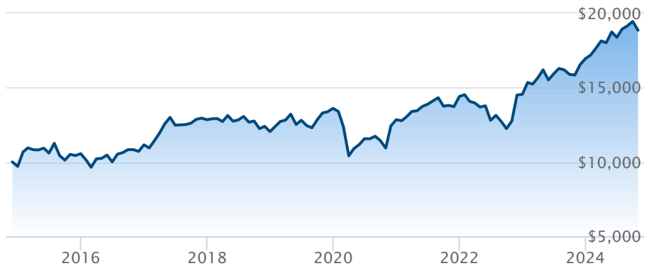
BMO International Dividend ETF (ZDI)