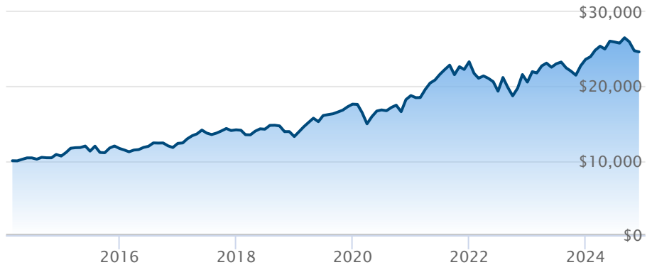
BMO MSCI Europe High Quality Hgd C$ Idx ETF (ZEQ)