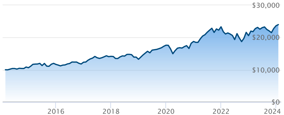
BMO MSCI Europe High Quality Hgd C$ Idx ETF (ZEQ)