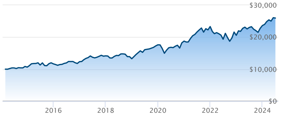
BMO MSCI Europe High Quality Hgd C$ Idx ETF (ZEQ)