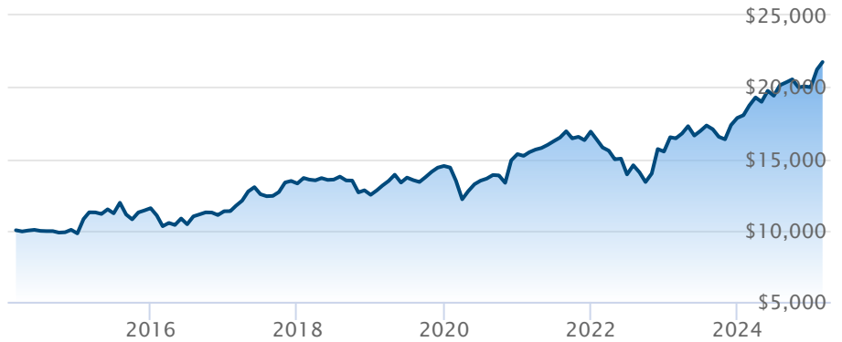
BMO MSCI EAFE Index ETF (ZEA)