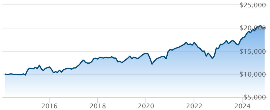
BMO MSCI EAFE Index ETF (ZEA)