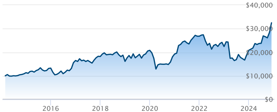
BMO Equal Weight US Banks Index ETF (ZBK)