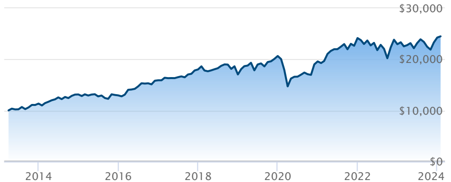
BMO US Dividend Hedged to CAD ETF (ZUD)

Past performance is no guarantee of future performance. All returns are historical annual compounded total rates of return and reflect changes in yield and distributions reinvested. Managed Indexed, Managed Portfolios and Market Indexed accounts credit an interest amount mirroring the net rate of return of a specified underlying investment, less a BMO Life Assurance Company daily management fee. These rates of return do not reflect the current BMO Life Assurance Company management /universal life fee which must be taken into consideration when determining the net return earned on the account.