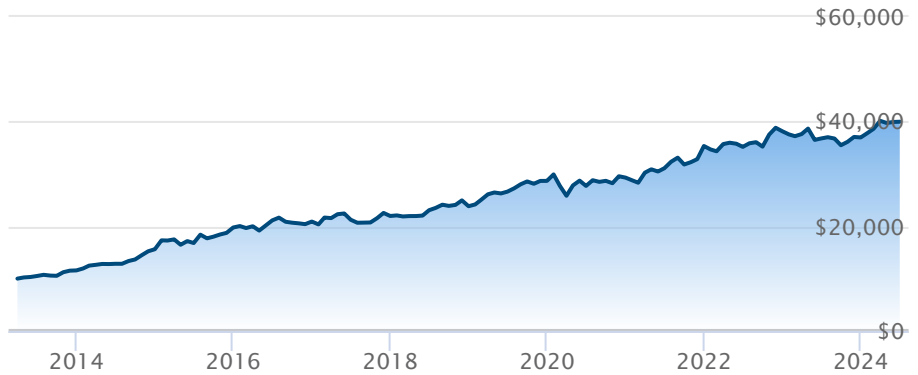
BMO Low Volatility US Equity ETF (ZLU)