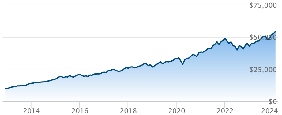
BMO S&P 500 Index ETF (ZSP)