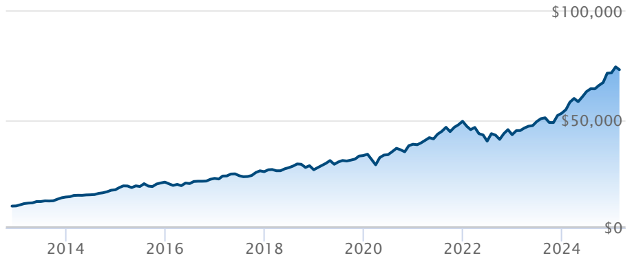
BMO S&P 500 Index ETF (ZSP)