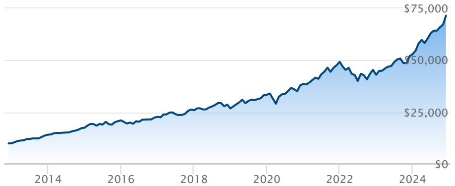
BMO S&P 500 Index ETF (ZSP)