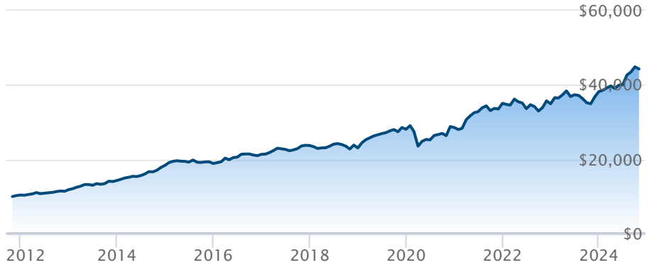
BMO Low Volatility Canadian Equity ETF (ZLB)