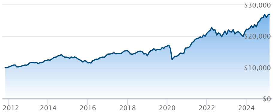
BMO Canadian Dividend ETF (ZDV)