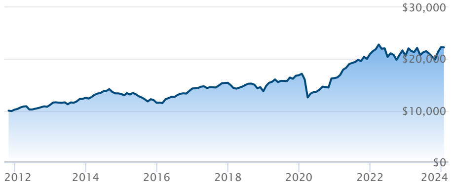
BMO Canadian Dividend ETF (ZDV)