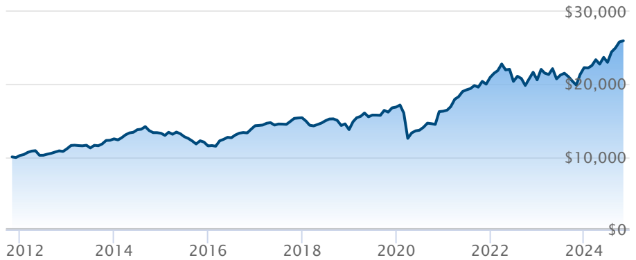
BMO Canadian Dividend ETF (ZDV)