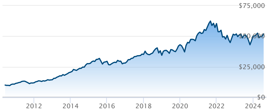
BMO Equal Weight US Health Care Hgd to CAD (ZUH)