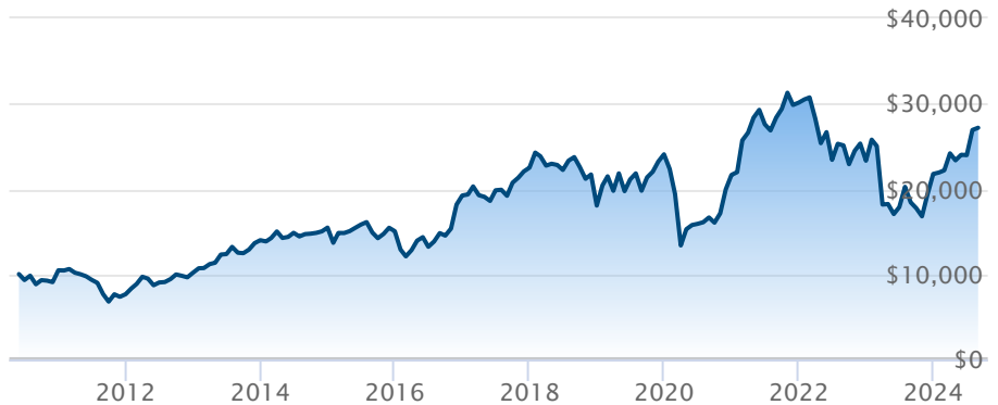
BMO Equal Weight US Banks Hgd to CAD Idx ETF (ZUB)

Past performance is no guarantee of future performance. All returns are historical annual compounded total rates of return and reflect changes in yield and distributions reinvested. Managed Indexed, Managed Portfolios and Market Indexed accounts credit an interest amount mirroring the net rate of return of a specified underlying investment, less a BMO Life Assurance Company daily management fee. These rates of return do not reflect the current BMO Life Assurance Company management /universal life fee which must be taken into consideration when determining the net return earned on the account.