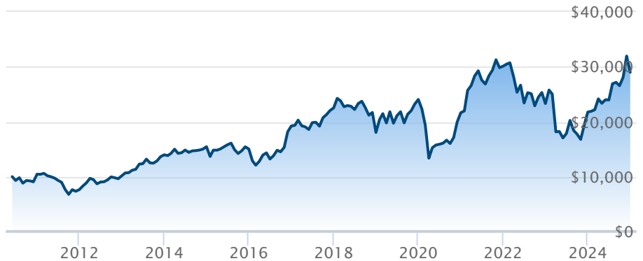
BMO Equal Weight US Banks Hgd to CAD Idx ETF (ZUB)