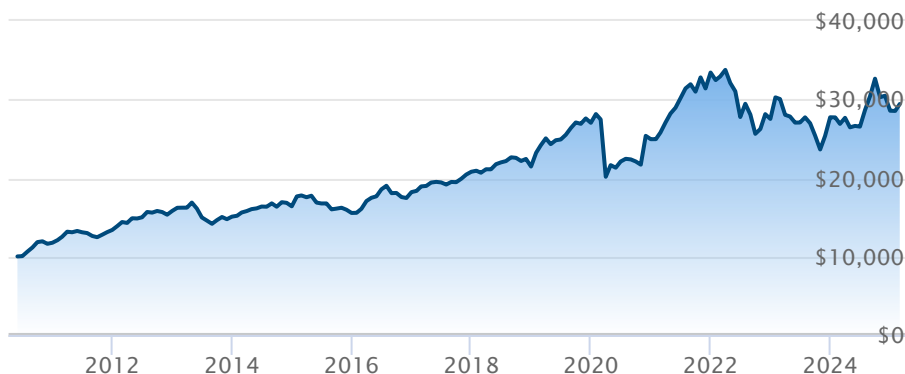
BMO Equal Weight REITs Index ETF (ZRE)