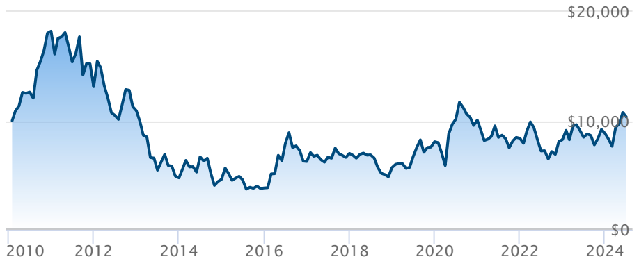
BMO Junior Gold Index ETF (ZJG)