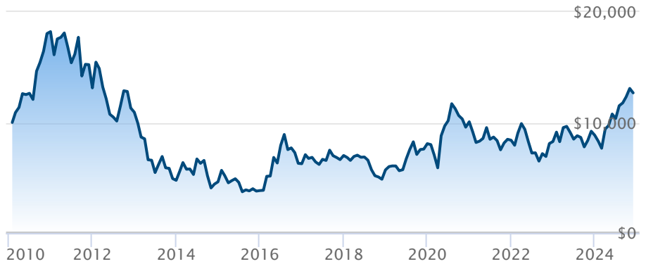
BMO Junior Gold Index ETF (ZJG)