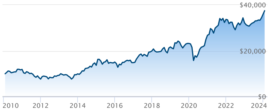
BMO MSCI India ESG Leaders Index ETF (ZID)