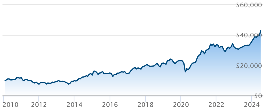
BMO MSCI India ESG Leaders Index ETF (ZID)