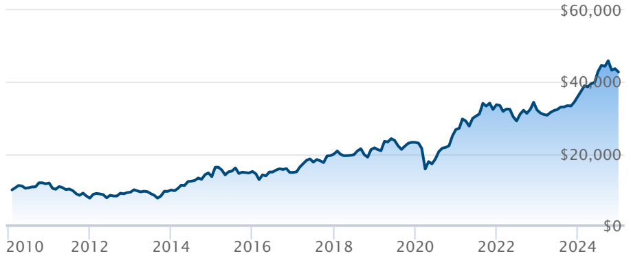
BMO MSCI India ESG Leaders Index ETF (ZID)