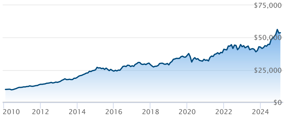
BMO Global Infrastructure Index ETF (ZGI)