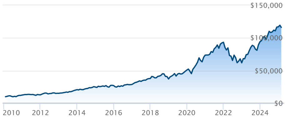
BMO Nasdaq 100 Equity Hedged to CAD Indx ETF (ZQQ)