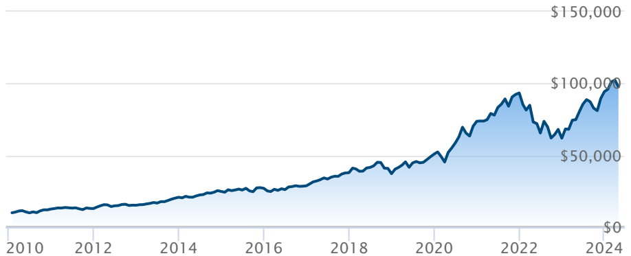
BMO Nasdaq 100 Equity Hedged to CAD Indx ETF (ZQQ)