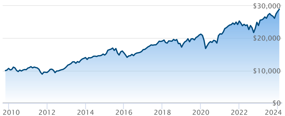
BMO MSCI EAFE Hedged to CAD Index ETF (ZDM)