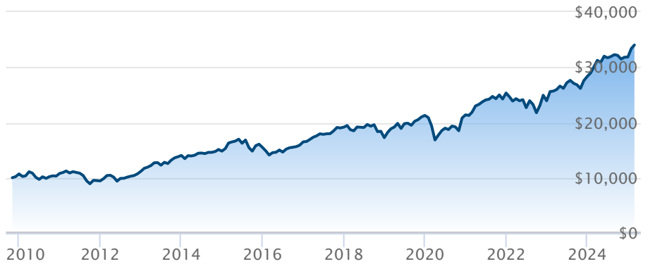
BMO MSCI EAFE Hedged to CAD Index ETF (ZDM)