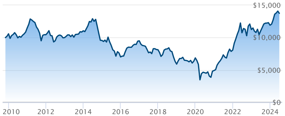
BMO Equal Weight Oil & Gas Index ETF (ZEO)