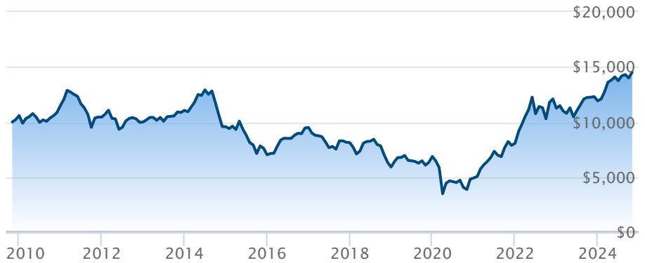
BMO Equal Weight Oil & Gas Index ETF (ZEO)