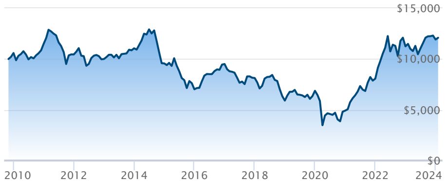
BMO Equal Weight Oil & Gas Index ETF (ZEO)