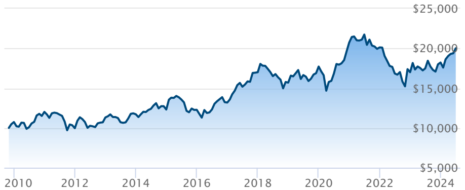
BMO MSCI Emerging Markets Index ETF (ZEM)