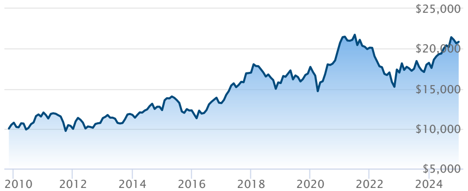
BMO MSCI Emerging Markets Index ETF (ZEM)