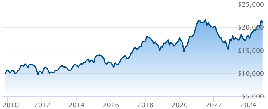
BMO MSCI Emerging Markets Index ETF (ZEM)