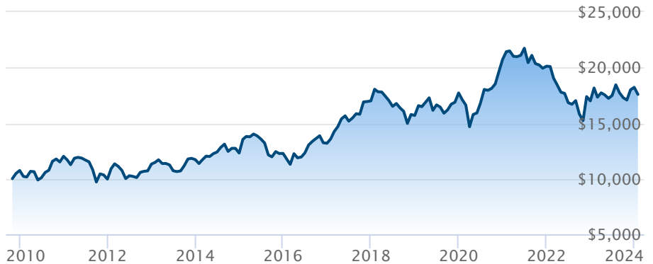
BMO MSCI Emerging Markets Index ETF (ZEM)