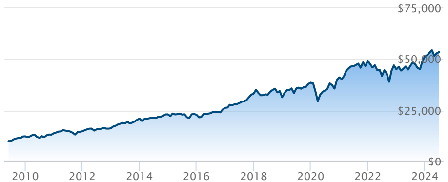
BMO Dow Jones Industrial Average Hgd to CAD (ZDJ)