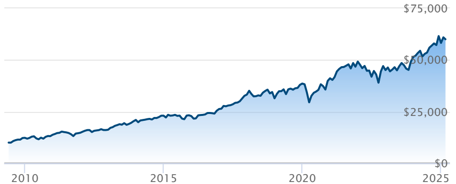
BMO Dow Jones Industrial Average Hgd to CAD (ZDJ)