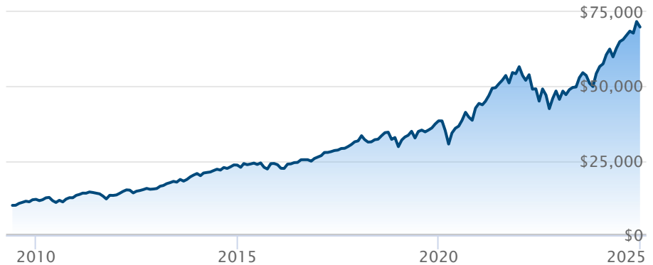
BMO S&P 500 Hedged to CAD Index ETF (ZUE)

Past performance is no guarantee of future performance. All returns are historical annual compounded total rates of return and reflect changes in yield and distributions reinvested. Managed Indexed, Managed Portfolios and Market Indexed accounts credit an interest amount mirroring the net rate of return of a specified underlying investment, less a BMO Life Assurance Company daily management fee. These rates of return do not reflect the current BMO Life Assurance Company management /universal life fee which must be taken into consideration when determining the net return earned on the account.