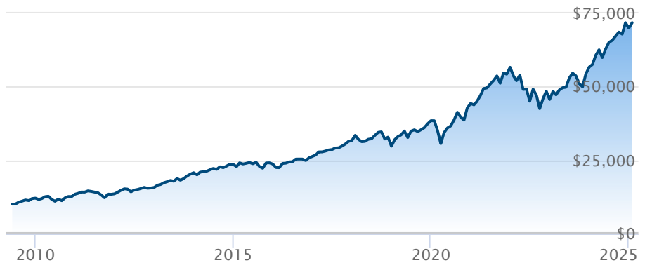
BMO S&P 500 Hedged to CAD Index ETF (ZUE)

Past performance is no guarantee of future performance. All returns are historical annual compounded total rates of return and reflect changes in yield and distributions reinvested. Managed Indexed, Managed Portfolios and Market Indexed accounts credit an interest amount mirroring the net rate of return of a specified underlying investment, less a BMO Life Assurance Company daily management fee. These rates of return do not reflect the current BMO Life Assurance Company management /universal life fee which must be taken into consideration when determining the net return earned on the account.