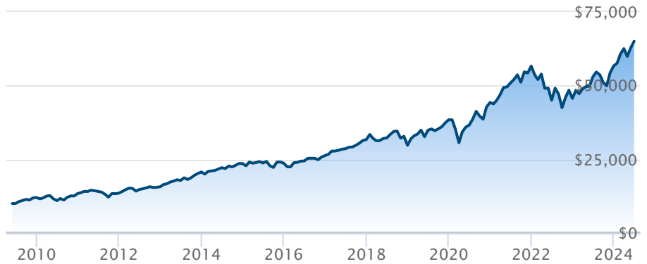
BMO S&P 500 Hedged to CAD Index ETF (ZUE)

Past performance is no guarantee of future performance. All returns are historical annual compounded total rates of return and reflect changes in yield and distributions reinvested. Managed Indexed, Managed Portfolios and Market Indexed accounts credit an interest amount mirroring the net rate of return of a specified underlying investment, less a BMO Life Assurance Company daily management fee. These rates of return do not reflect the current BMO Life Assurance Company management /universal life fee which must be taken into consideration when determining the net return earned on the account.