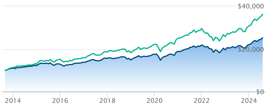
BMO Equity Growth ETF Portfolio - Advisor Series Dow Jones Global TR Index (C$)

The information contained on this page is related only to the designated fund or funds shown above. As part of a BMO Life Assurance Company policy, you do not purchase units in this designated fund or a legal interest in any security.