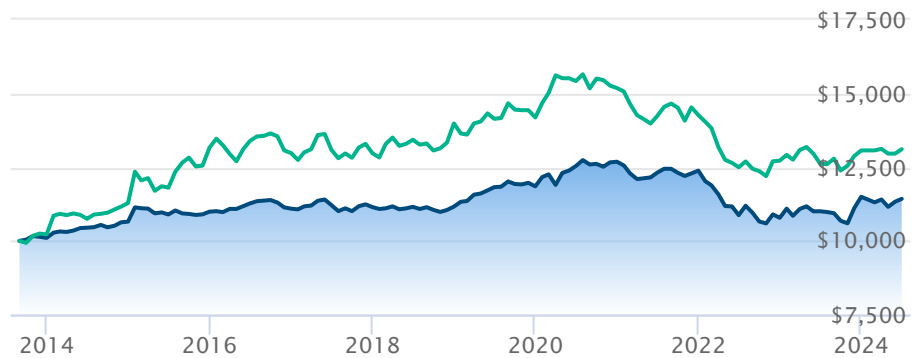
BMO Fixed Income ETF Portfolio Advisor Series ICE BofA Global Broad Market Index TR CAD

The information contained on this page is related only to the designated fund or funds shown above. As part of a BMO Life Assurance Company policy, you do not purchase units in this designated fund or a legal interest in any security.