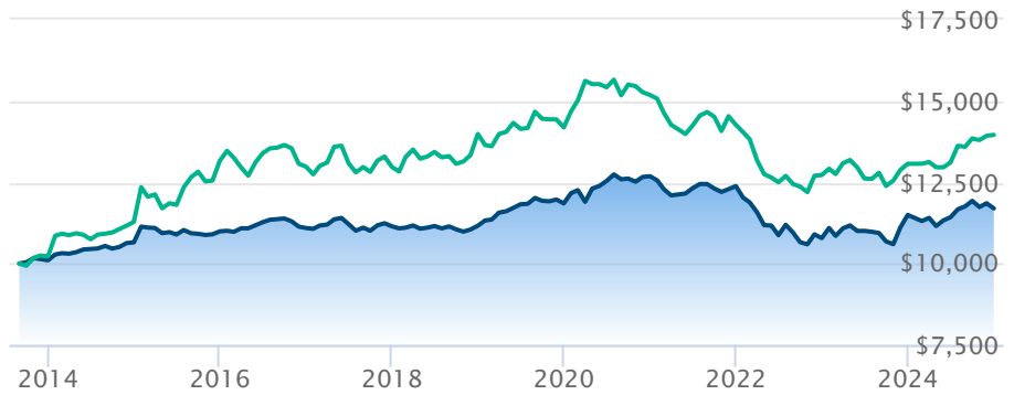
BMO Fixed Income ETF Portfolio Advisor Series ICE BofA Global Broad Market Index TR CAD

The information contained on this page is related only to the designated fund or funds shown above. As part of a BMO Life Assurance Company policy, you do not purchase units in this designated fund or a legal interest in any security.