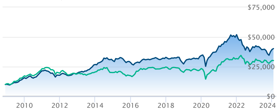
BMO Canadian Small Cap Equity Fund Advisor Series S&P/TSX Smallcap Index TR

The information contained on this page is related only to the designated fund or funds shown above. As part of a BMO Life Assurance Company policy, you do not purchase units in this designated fund or a legal interest in any security.