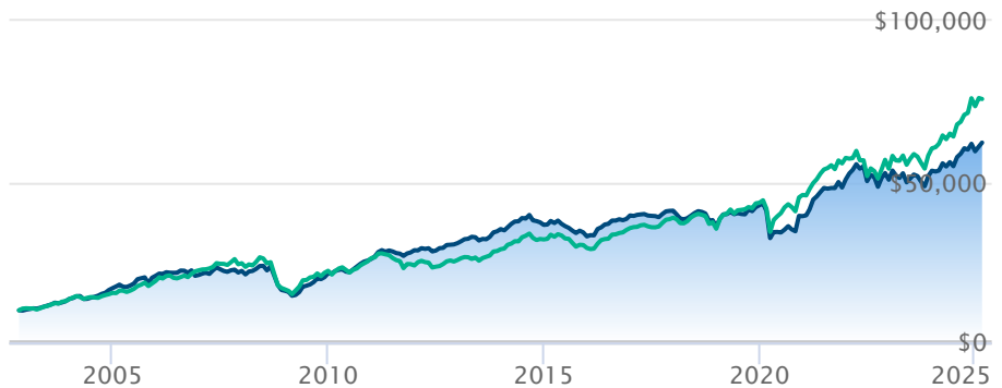
BMO Monthly High Income Fund II Advisor Series S&P/TSX Composite Index TR

The information contained on this page is related only to the designated fund or funds shown above. As part of a BMO Life Assurance Company policy, you do not purchase units in this designated fund or a legal interest in any security.