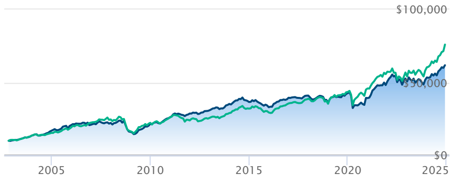
BMO Monthly High Income Fund II Advisor Series S&P/TSX Composite Index TR

The information contained on this page is related only to the designated fund or funds shown above. As part of a BMO Life Assurance Company policy, you do not purchase units in this designated fund or a legal interest in any security.