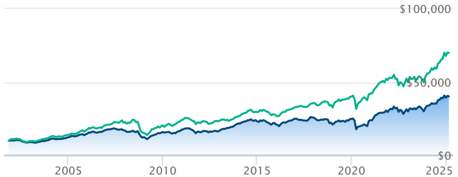
Invesco Pure Canadian Equity Class Series A