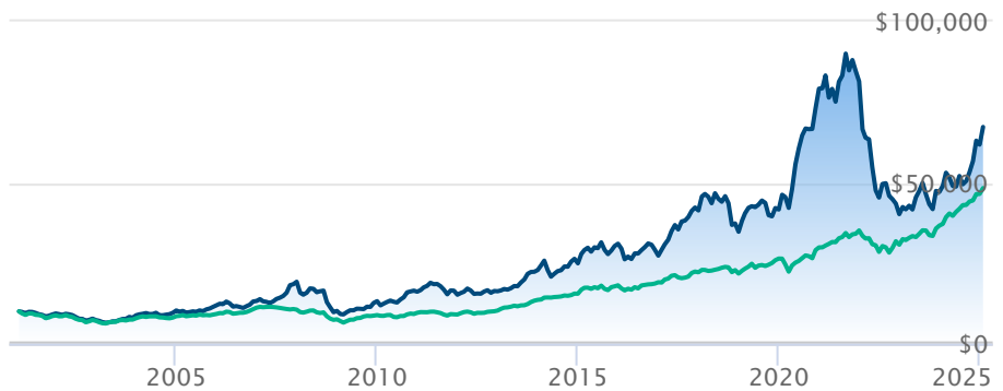
Dynamic Power Global Growth Class Series A Dow Jones Global TR Index (C$)

The information contained on this page is related only to the designated fund or funds shown above. As part of a BMO Life Assurance Company policy, you do not purchase units in this designated fund or a legal interest in any security.