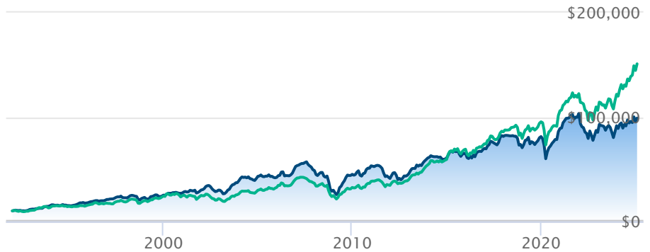
Franklin Royce Global Small Cap Premier Fund Ser A Dow Jones Global Small-Cap TR Index (C$)

The information contained on this page is related only to the designated fund or funds shown above. As part of a BMO Life Assurance Company policy, you do not purchase units in this designated fund or a legal interest in any security.