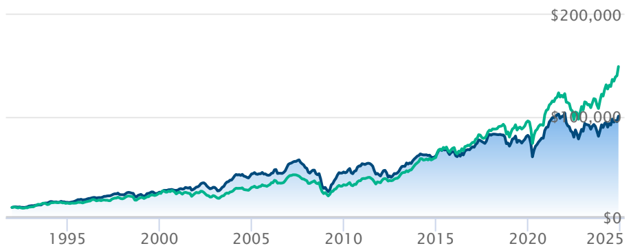
Franklin Royce Global Small Cap Premier Fund Ser A Dow Jones Global Small-Cap TR Index (C$)

The information contained on this page is related only to the designated fund or funds shown above. As part of a BMO Life Assurance Company policy, you do not purchase units in this designated fund or a legal interest in any security.