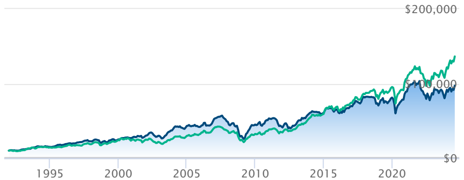
Franklin Royce Global Small Cap Premier Fund Ser A Dow Jones Global Small-Cap TR Index (C$)

The information contained on this page is related only to the designated fund or funds shown above. As part of a BMO Life Assurance Company policy, you do not purchase units in this designated fund or a legal interest in any security.