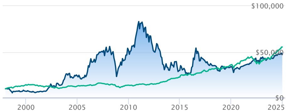
AGF Global Real Assets Fund Mutual Fund Series Fundata Global Balanced - Equity Focus Index

The information contained on this page is related only to the designated fund or funds shown above. As part of a BMO Life Assurance Company policy, you do not purchase units in this designated fund or a legal interest in any security.