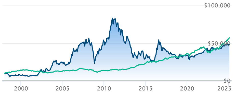
AGF Global Real Assets Fund Mutual Fund Series Fundata Global Balanced - Equity Focus Index

The information contained on this page is related only to the designated fund or funds shown above. As part of a BMO Life Assurance Company policy, you do not purchase units in this designated fund or a legal interest in any security.