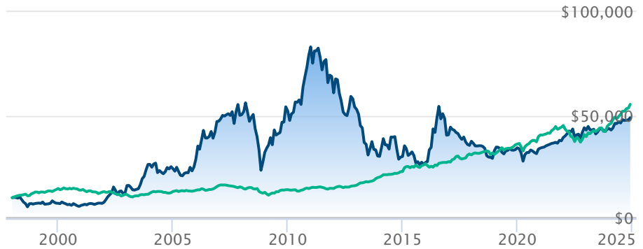
AGF Global Real Assets Fund Mutual Fund Series Fundata Global Balanced - Equity Focus Index

The information contained on this page is related only to the designated fund or funds shown above. As part of a BMO Life Assurance Company policy, you do not purchase units in this designated fund or a legal interest in any security.