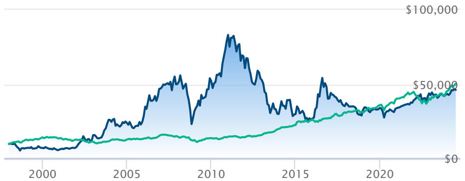
AGF Global Real Assets Fund Mutual Fund Series Fundata Global Balanced - Equity Focus Index

The information contained on this page is related only to the designated fund or funds shown above. As part of a BMO Life Assurance Company policy, you do not purchase units in this designated fund or a legal interest in any security.