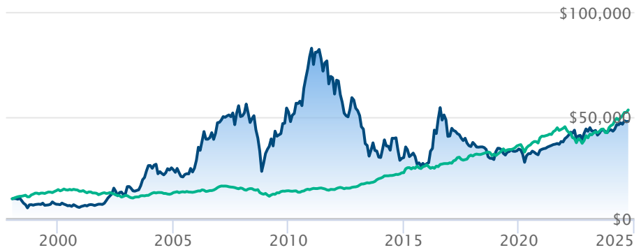
AGF Global Real Assets Fund Mutual Fund Series Funddata Global Balanced - Equity Focus Index

The information contained on this page is related only to the designated fund or funds shown above. As part of a BMO Life Assurance Company policy, you do not purchase units in this designated fund or a legal interest in any security.