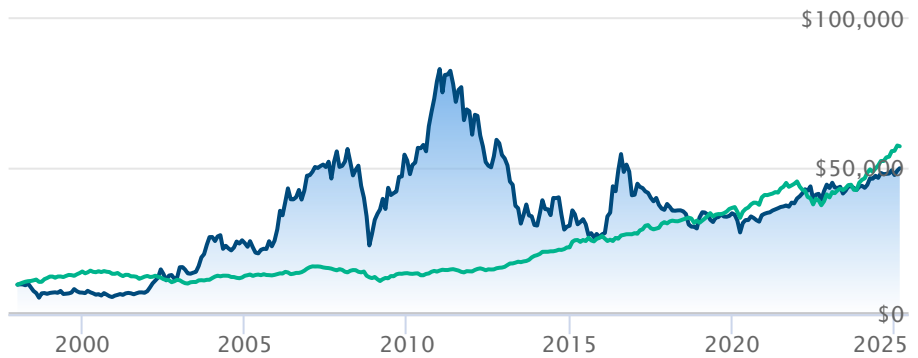
AGF Global Real Assets Fund Mutual Fund Series Funddata Global Balanced - Equity Focus Index

The information contained on this page is related only to the designated fund or funds shown above. As part of a BMO Life Assurance Company policy, you do not purchase units in this designated fund or a legal interest in any security.