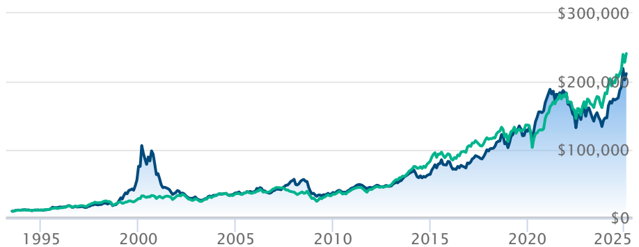
AGF U.S. Small-Mid Cap Fund Mutual Fund Series Dow Jones U.S. Small-Cap TR Index (C$)

The information contained on this page is related only to the designated fund or funds shown above. As part of a BMO Life Assurance Company policy, you do not purchase units in this designated fund or a legal interest in any security.