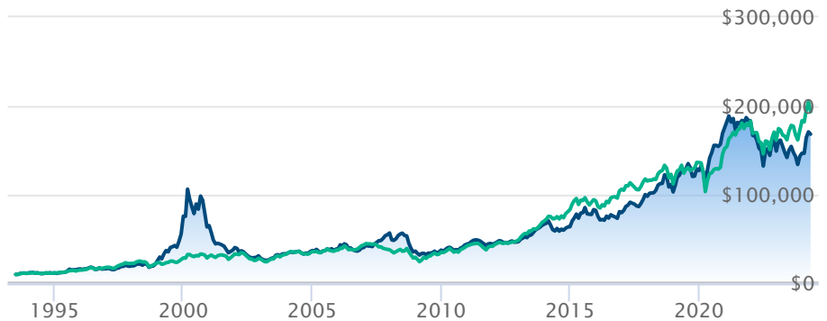
AGF U.S. Small-Mid Cap Fund Mutual Fund Series Dow Jones U.S. Small-Cap TR Index (C$)

The information contained on this page is related only to the designated fund or funds shown above. As part of a BMO Life Assurance Company policy, you do not purchase units in this designated fund or a legal interest in any security.