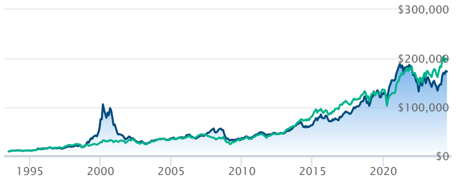
AGF U.S. Small-Mid Cap Fund Mutual Fund Series Dow Jones U.S. Small-Cap TR Index (C$)

The information contained on this page is related only to the designated fund or funds shown above. As part of a BMO Life Assurance Company policy, you do not purchase units in this designated fund or a legal interest in any security.